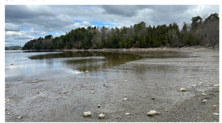
This photo shows East Cove 3 during low tide in May 2024.

Because the TLC Pilot area is adjacent to protected natural resources in coastal wetlands and the Penobscot River, the Remediation Trust needs a Natural Resources Protection Act (NRPA) Department permit from the Maine Environmental Protection (DEP) and the U.S. Army Corps of Engineers (USACE). Maine DEP and USACE will review the NRPA permit application with other agencies (Maine Department of Marine Resources, Maine Inland Fisheries and Wildlife. Fish and Wildlife Service, and U.S. Environmental Protection Agency) and seek public comment.